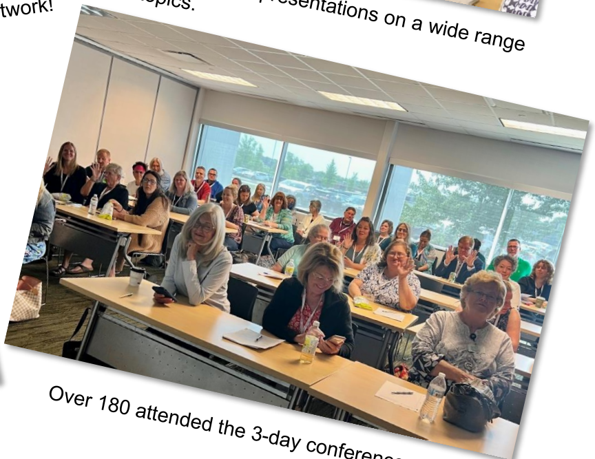
Over 180 attended the 3-day conference.