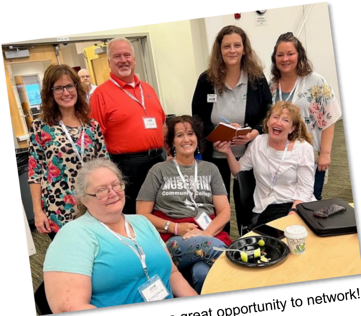
The conference was a great opportunity to network!

Did you miss a presentation? You can see the handouts at: https://2022adulthoodeducationandliteracy.sched.com/