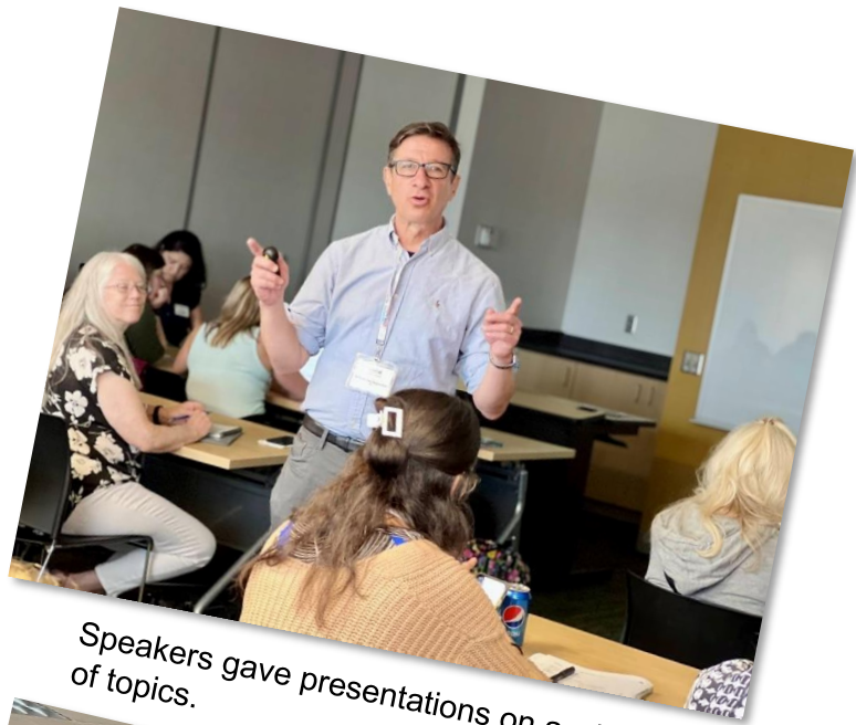
Speakers gave presentations on a wide range of topics.